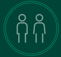
Ladies and gentlemen WC's