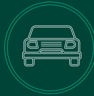
11 car parking spaces