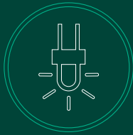
Suspended ceilings with integrated lighting