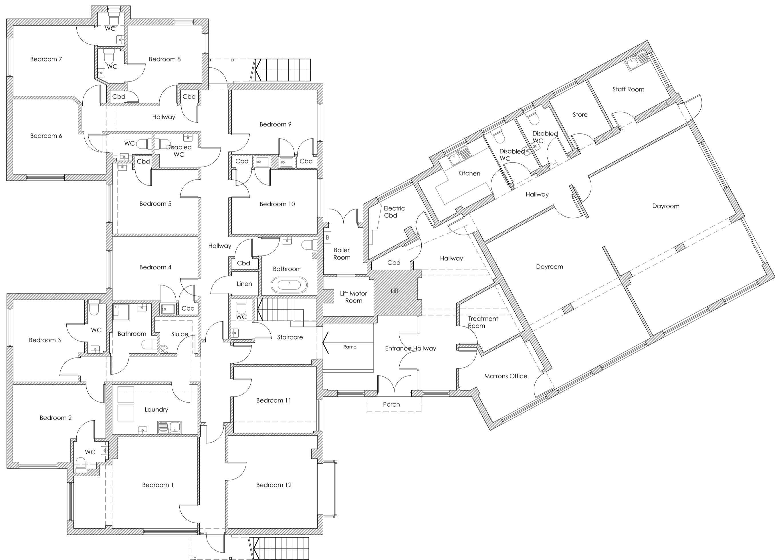
Existing Ground Floor Plan Scale 1:100