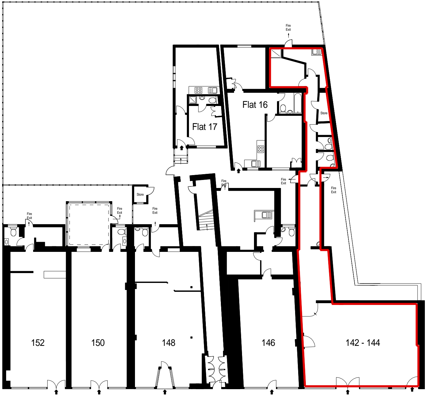
Ground Floor. Front Of Building